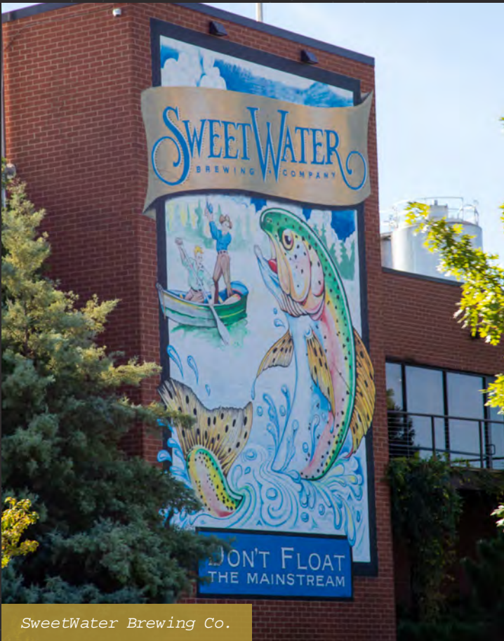
SweetWater Brewing Co.