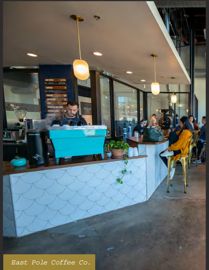
East Pole Coffee Co.