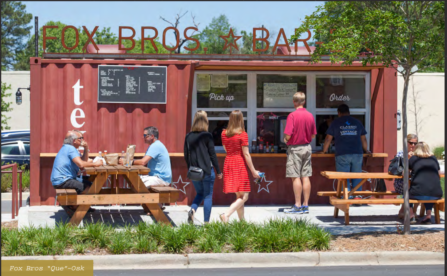
Fox Bros "Que"-Osk