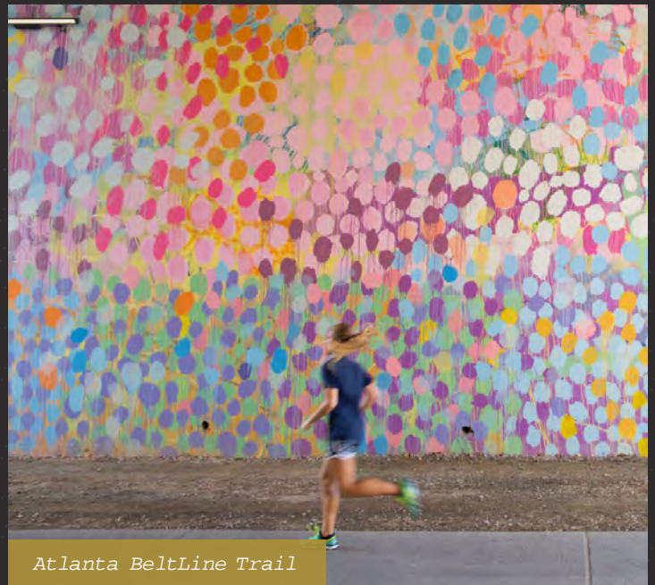
Atlanta BeltLine Trail