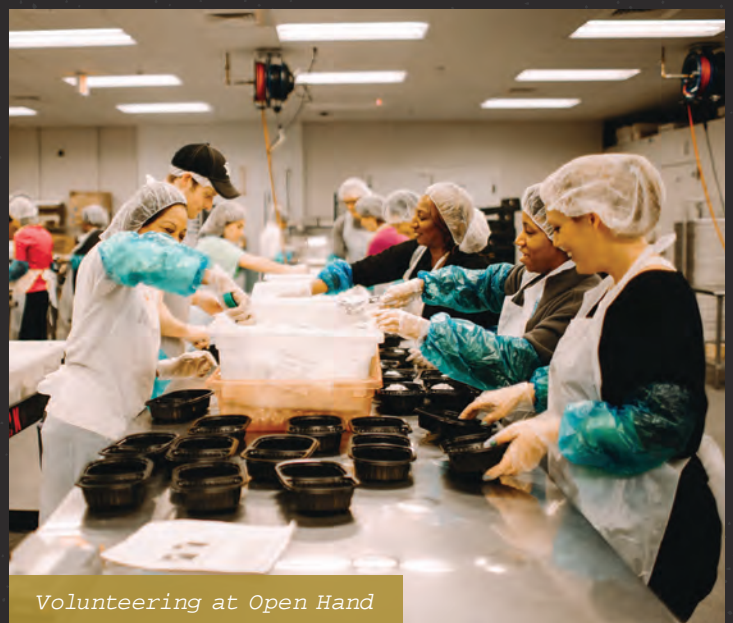
Volunteering at Open Hand