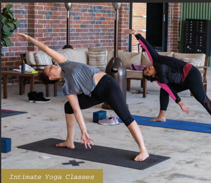
Intimate Yoga Classes