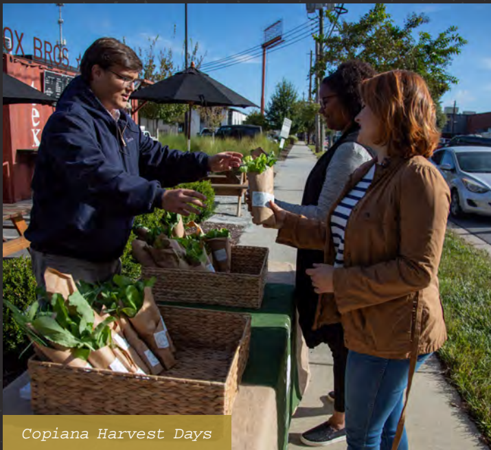
Copiana Harvest Days